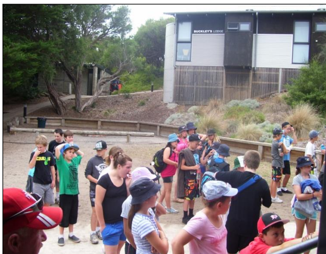
Year 6 Camp